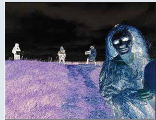
LOOKS COULD CHILL... masked Puca festival character